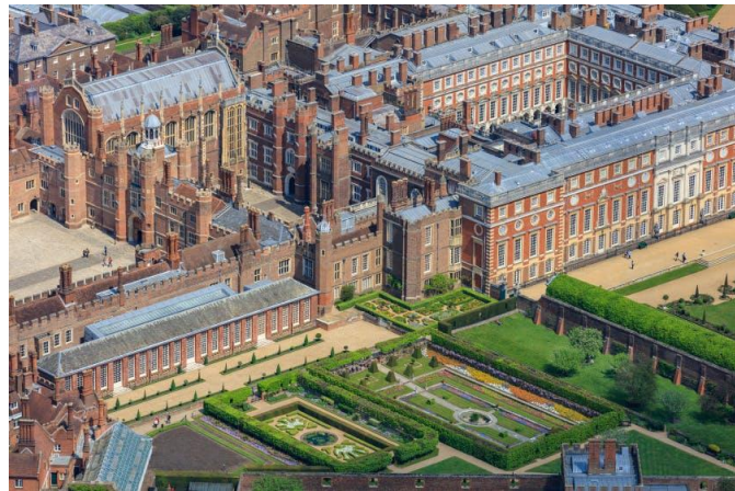
2 Hampton Court Palace

This same general approach to project development was adopted by wealthy private individuals. For example the initial phase of the construction of Hampton Court Palace was directed and funded by Cardinal Thomas Wolsey as his personal residence with works starting in 1514 and completing in 1529, after ownership had transferred to Henry VIII.