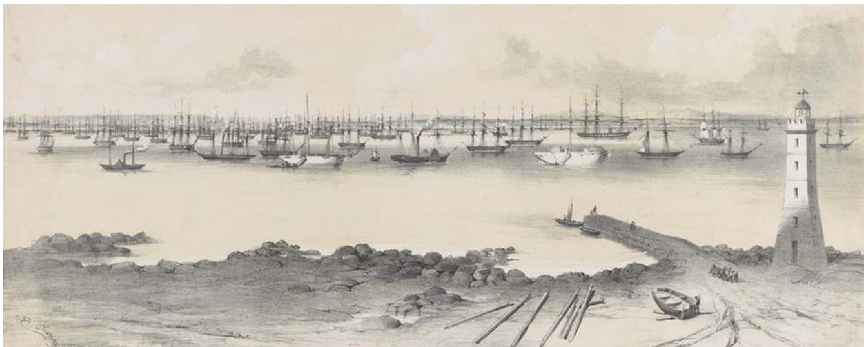
A picture of Hobsons Bay painted in the late 1800s from across the bay at Williamstown

In the meantime, the shipping problem was becoming serious: