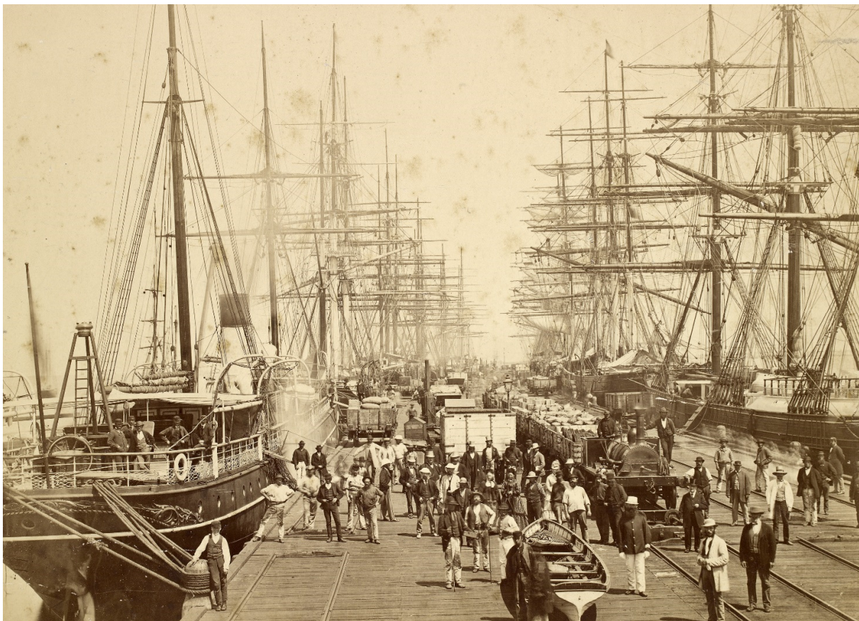
The Railway Pier at Sandridge (now Port Melbourne). Railway safety protocols appear to be very different in the 1860s.

The railway was an instant financial success, as its fares were high and the route popular. The journey took about 10 minutes with two trains running every half hour.