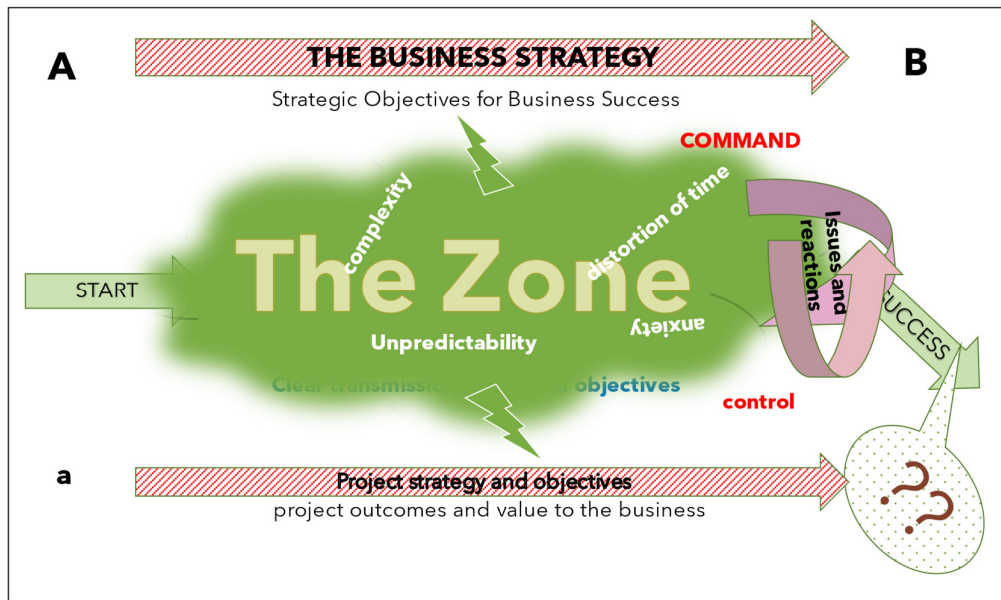
Figure 4: A more realistic view of the transition from business strategy to project

Figure 4 shows the more realistic picture of what happens in the Zone. Management’s expectations remain unwavering 5 , but the outcomes are not so predictable. The simple direct line of assumption between the executive’s articulation of strategic objectives, and the project work that is approved and resourced will most likely deviate. The path for delivery is affected by unexpected events, and senior stakeholders and the project team will react to try to regain control of the delivery of the objectives. Often these adjustments cause more disruption within the project and its relationships with other projects.