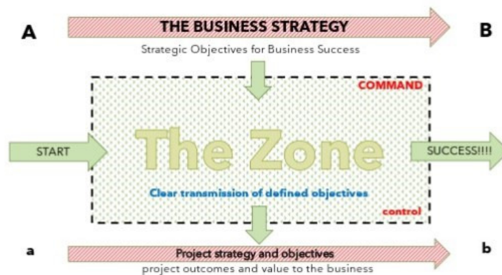
Figure 3: Idealized view of how projects will deliver the organization’s business strategy

Figure 3 describes the idealized Zone. Clear management direction and defined outcomes are shown as unclouded by culture or unconscious bias, and without any divergence or conflict. Clear transmission of strategic (organizational) visions into tactical (project) objectives ensure that projects will be delivered to the required time, cost, and quality. This view supports the assumption is that there will be a universal agreement from all stakeholders that the chosen path is the best and only path for optimal delivery of value to the organization.